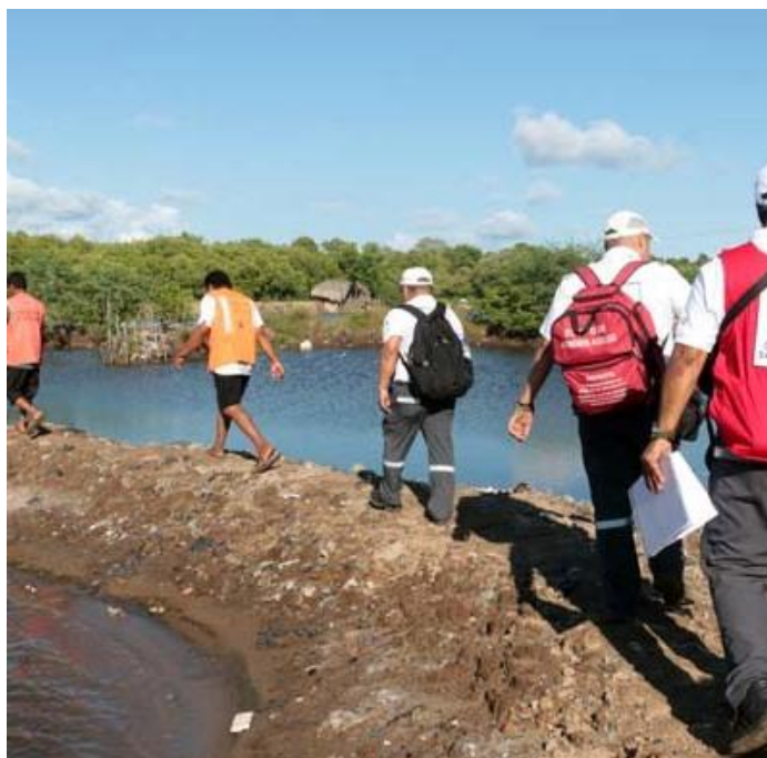
Photo 1: Salvadorean Red Cross Society (SRCS) volunteers carrying out assessments in the affected communities.

On 13 October, the National Civil Protection System of El Salvador issued a nation-wide green alert. The Salvadorean Red Cross Society (SRCS) activated its Emergency Operations Centre (EOC). By 14 October, Civil Protection issued warnings of rainfall and isolated thunderstorms, with increased risk in areas of high vulnerability to landslides. 1