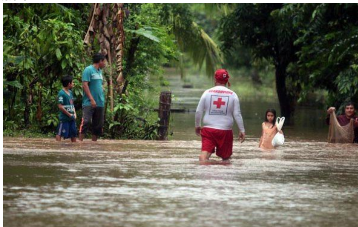
Photo 3: SRCS volunteer assisting affected families in Ilopango. Source: SRCS, 18 October 2019.

After the government's declaration of green alert, the SRCS activated its Emergency Operations Centre. The EOC has remained open since then. Additionally, 64 SRCS branches were activated with an average of 372 volunteers mobilized daily.