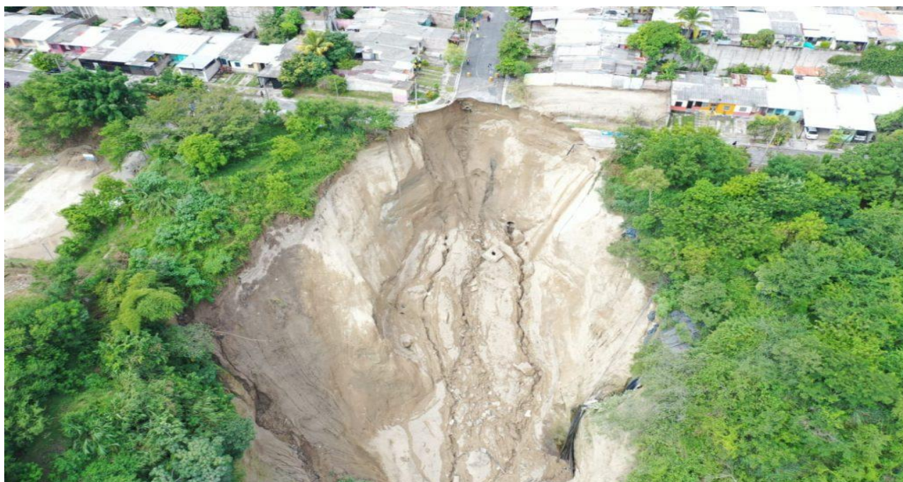
Photo 2: Heavy rain caused a landslide which left a 70-meter-deep hole in the residential area of Santa Lucia, Ilopango, San Salvador department. October 2019.

There are currently no official figures regarding the number of people affected by the floods in the country. Civil Protection has released initial figures for the municipalities of Zacatecoluca, Jiquilisco, Puerto El Triunfo, Tecoluca, San Luis La Herradura, Sonsonate, Tecoluca, San Salvador, La Libertad and Cuscatlán. This DREF operation is focused on the municipalities of Jiquilisco, Ilopango, Tecoluca, Puerto El Triunfo, and Puerto Parada. Other affected municipalities are not included in this DREF operation since authorities are responding to the humanitarian needs and further SRCS support is not needed.