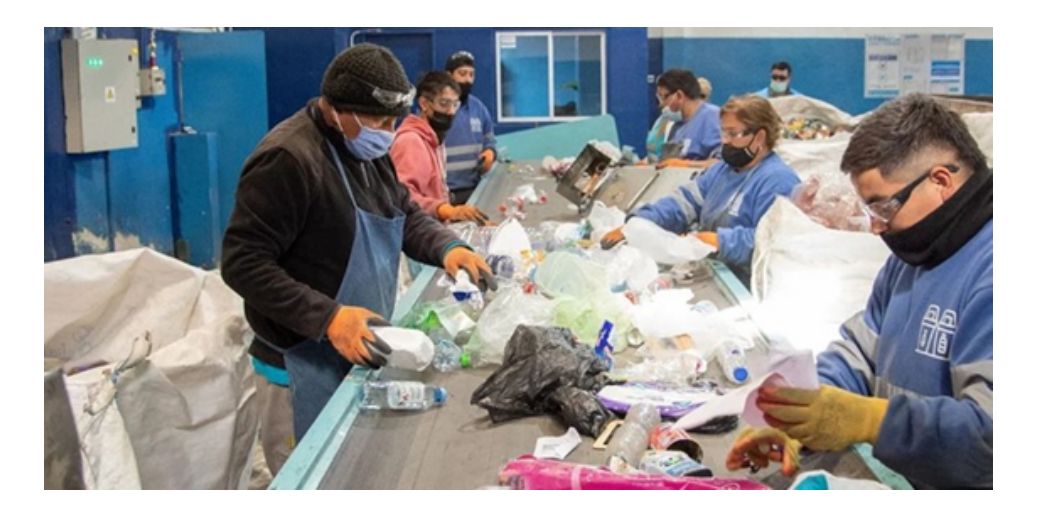
Public recycling center

Dirty materials: A mixed waste processing system accepts a stream of mixed solid waste and then proceeds to separate the designated recyclable materials through a combination of manual and mechanical sorting. Sorted recyclables may undergo additional processing necessary to meet technical specifications set by end markets, while the remainder of the mixed waste stream is sent to a disposal facility, such as a landfill.